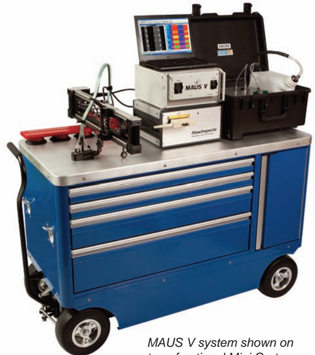
MAUS V system shown on top of optional Mini Cart